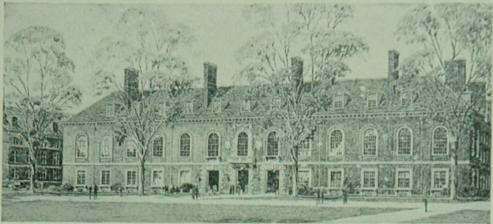
THE NEW LIBRARY