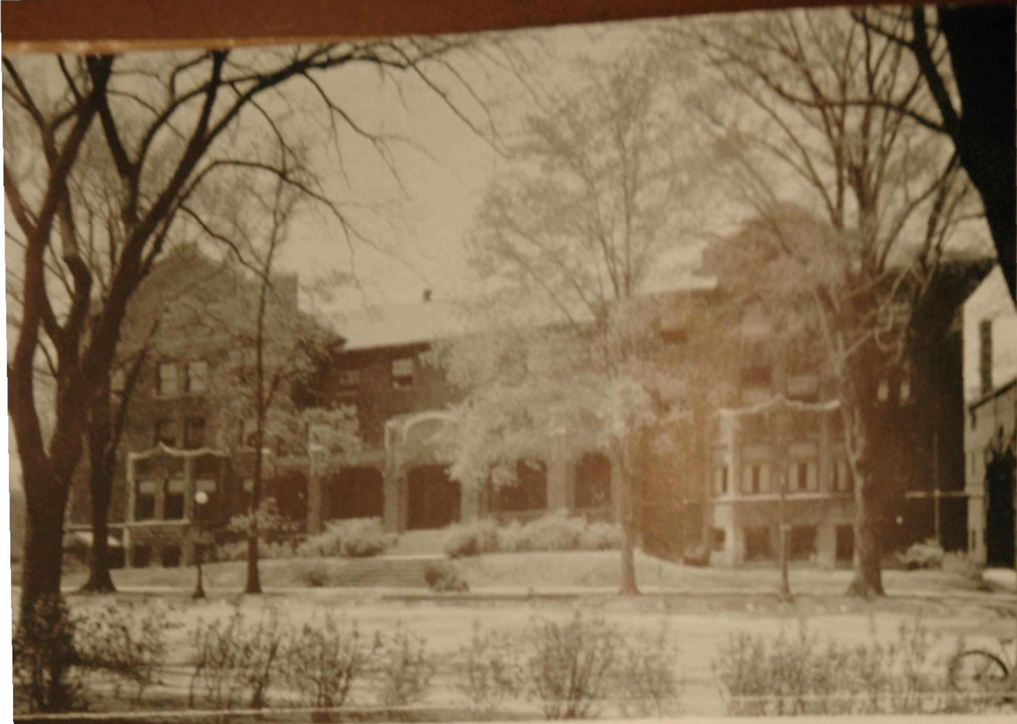
Next door to everything is Illini Hall, just across from the law building