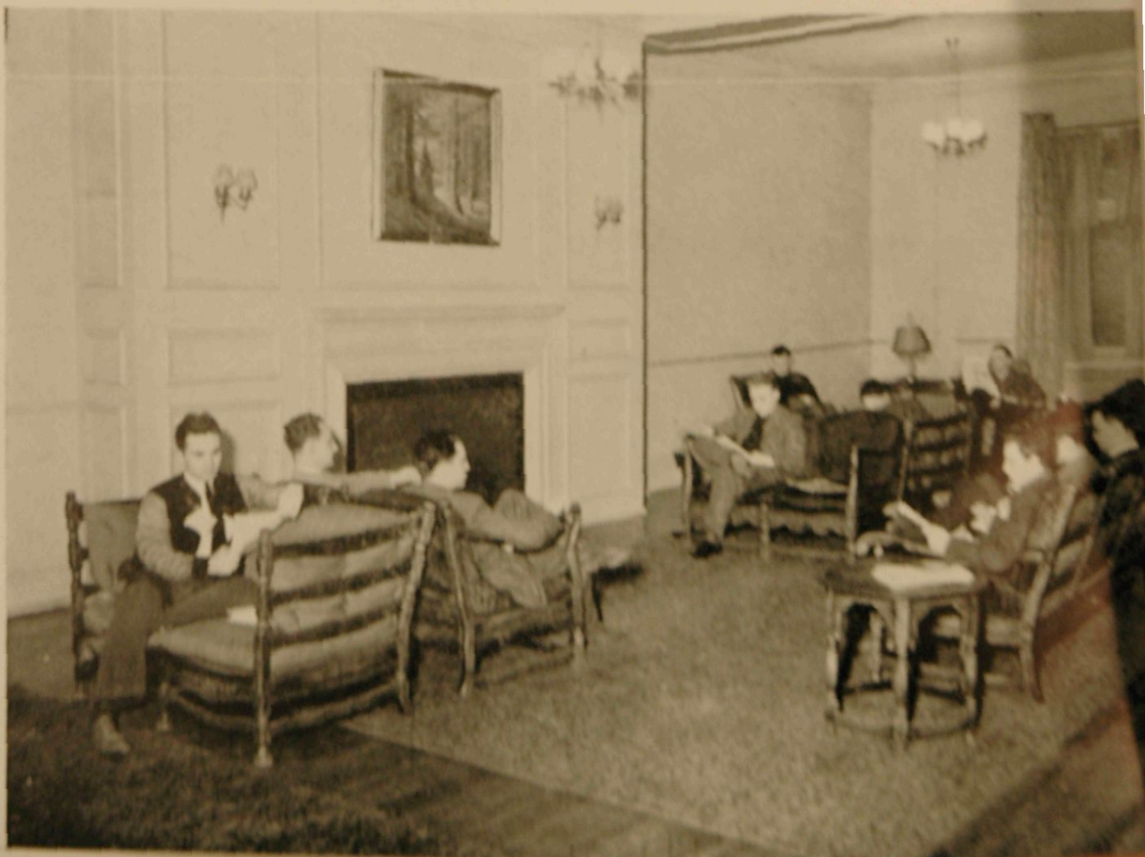
Illini Hall lounge is planned for reading, conversation, or relaxation

communications, inquiries, and requests for contracts to DIRECTOR OF RESIDENCE HALLS, 725 SOUTH WRIGHT STREET, CHAMPAIGN, ILLINOIS. The office, handling all university residence halls, is ready to provide further information and answer all questions. It will be glad to help solve the problem of your summer session home.