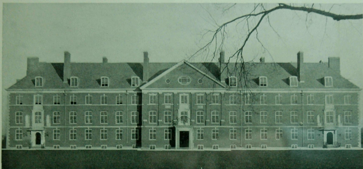
THE NEW AGRICULTURAL BUILDING