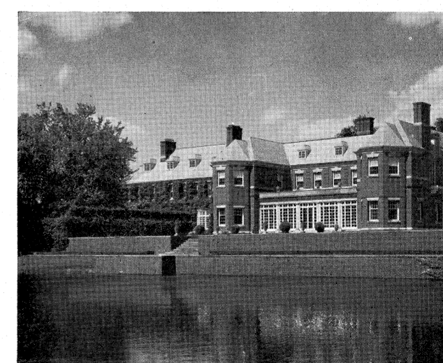
Robert Allerton Park is a part of a 5,518-acre estate, a $1,286,826 gift to the University in 1945. The park is open daily. It is 26 miles from Urbana-Champaign, over Illinois highways 10 and 47 to Monticello where a sign indicates the five-mile township road to the park.