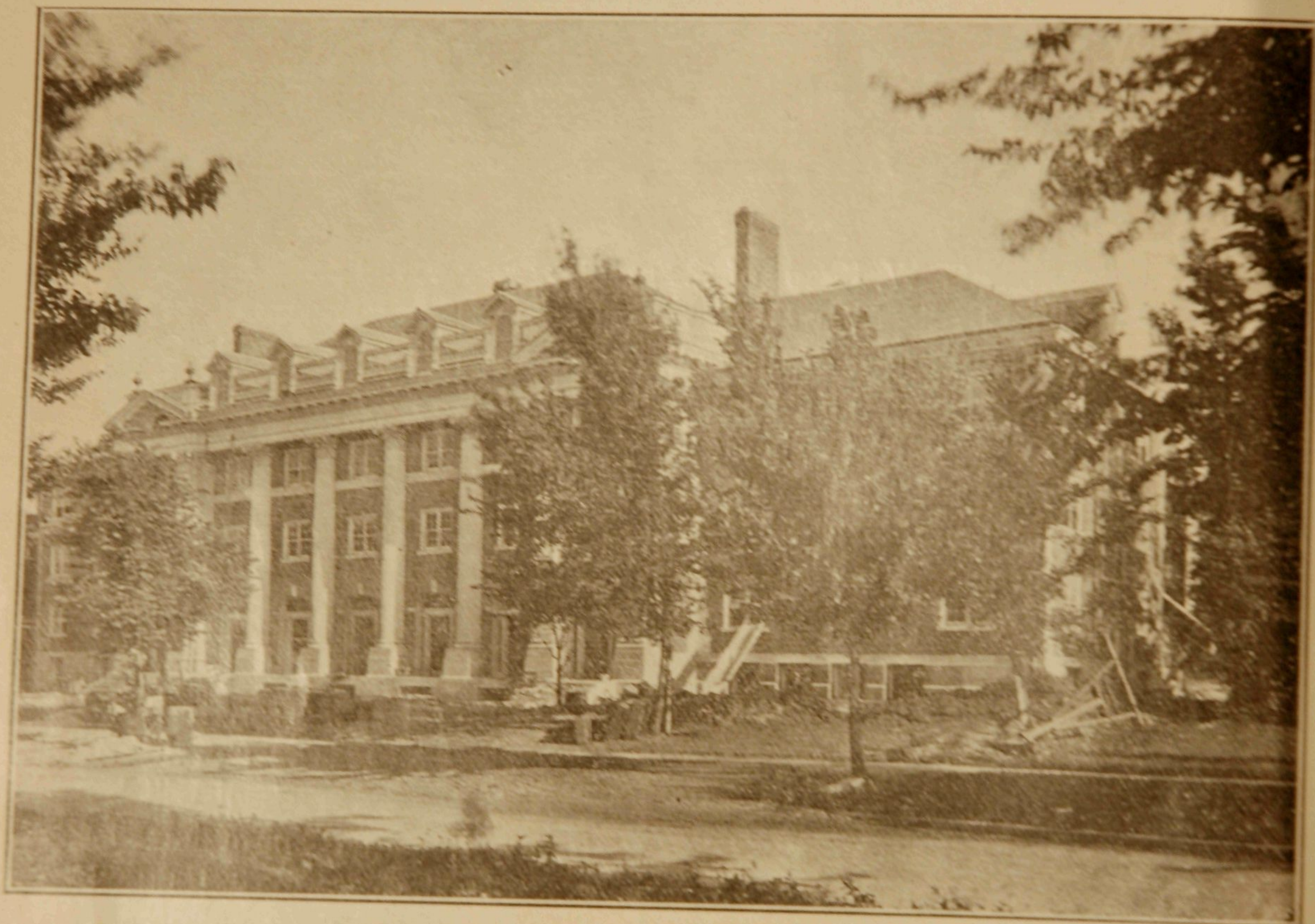
NEW WOMAN'S RESIDENCE HALL Turned for the use of the Aviators