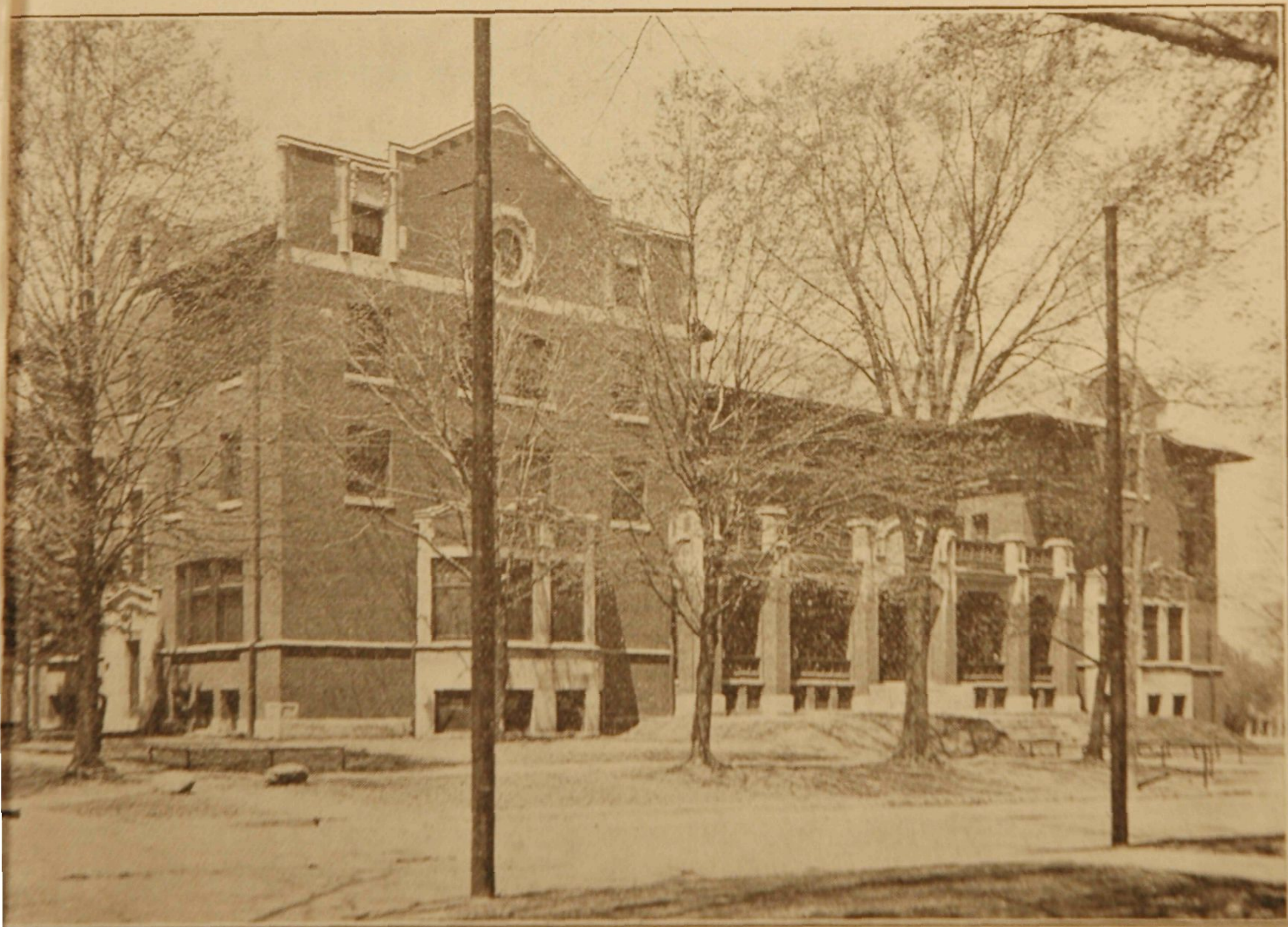
BARRACKS FOR THE AVIATORS—Y. M. C. A. BUILDING